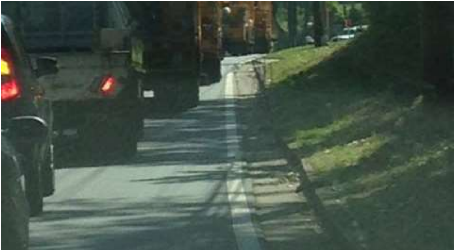
Crews making their way into the City