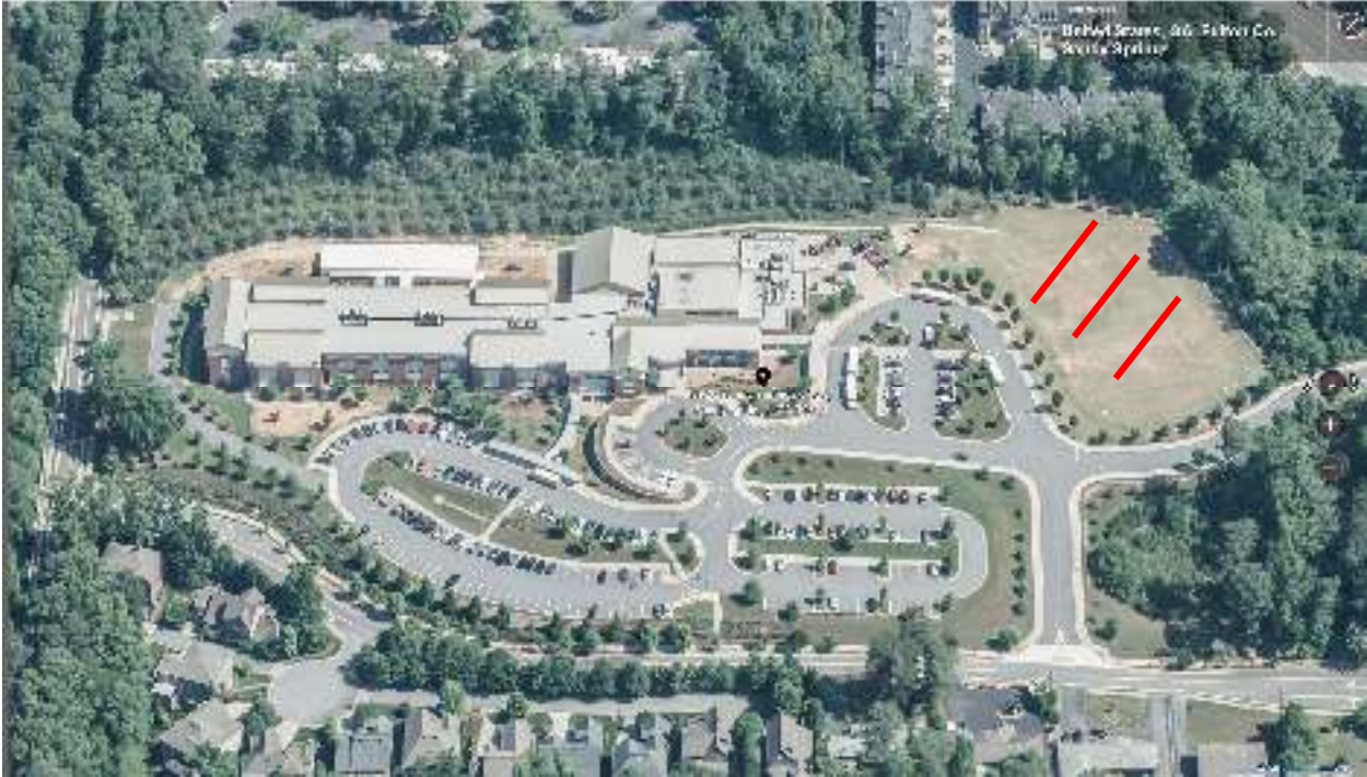
EXHIBIT A Premises (Field)